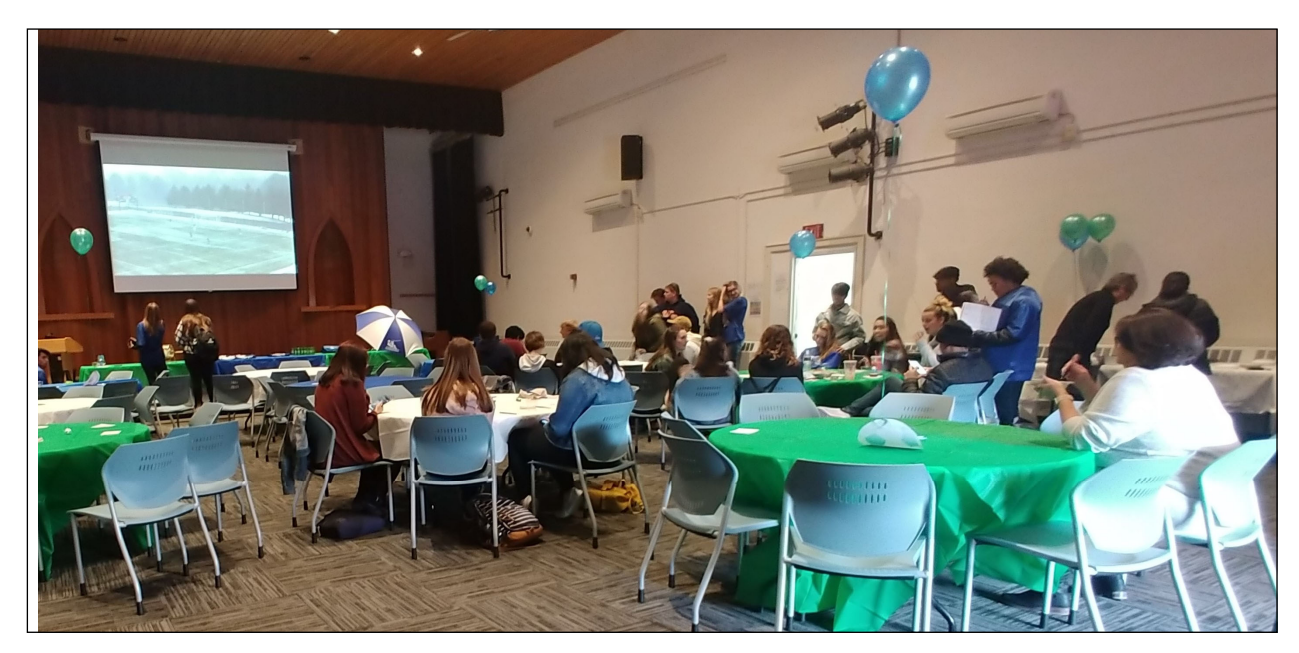
Students gathered to watch the school's men and women's soccer teams compete nationally.