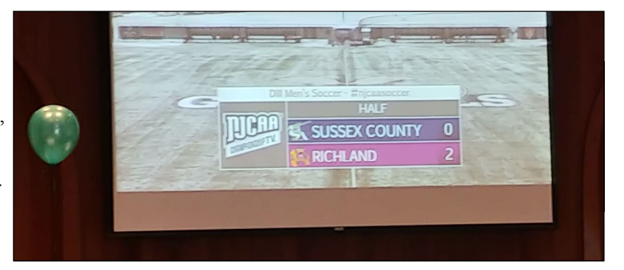
Unfortunately for the Skylanders, the second half wasn't any better.

He also said the school was exploring the possibility of adding women's lacrosse and volleyball programs as well.