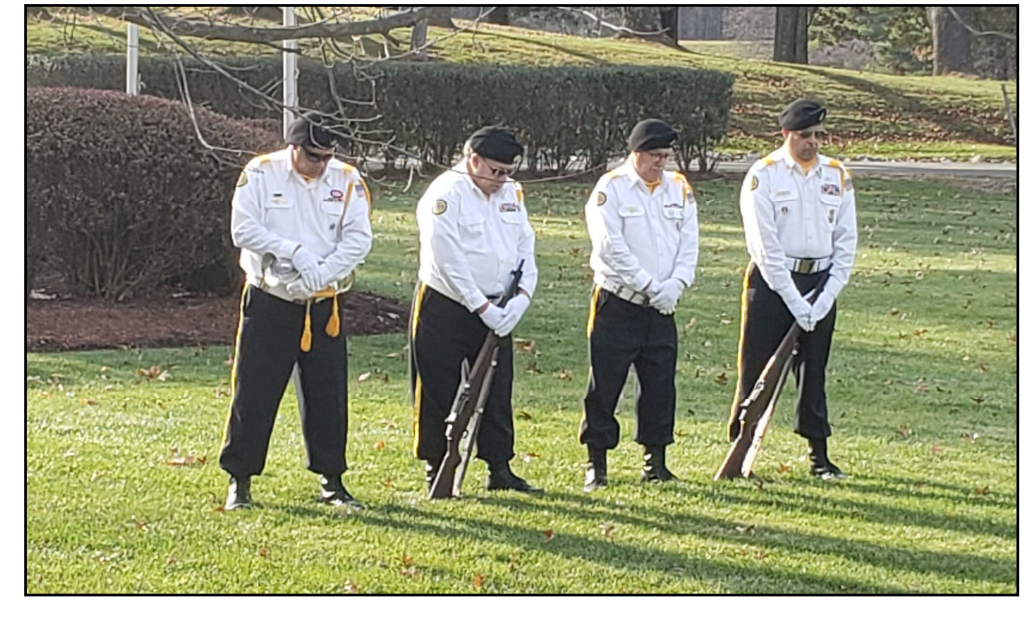
The Honor Guard from American Legion Post #86, Newton, stands in tribute to the nation and those who have served for it.

Worry no more! You are going to be safe from unwanted wear and tear right before the winter and spring