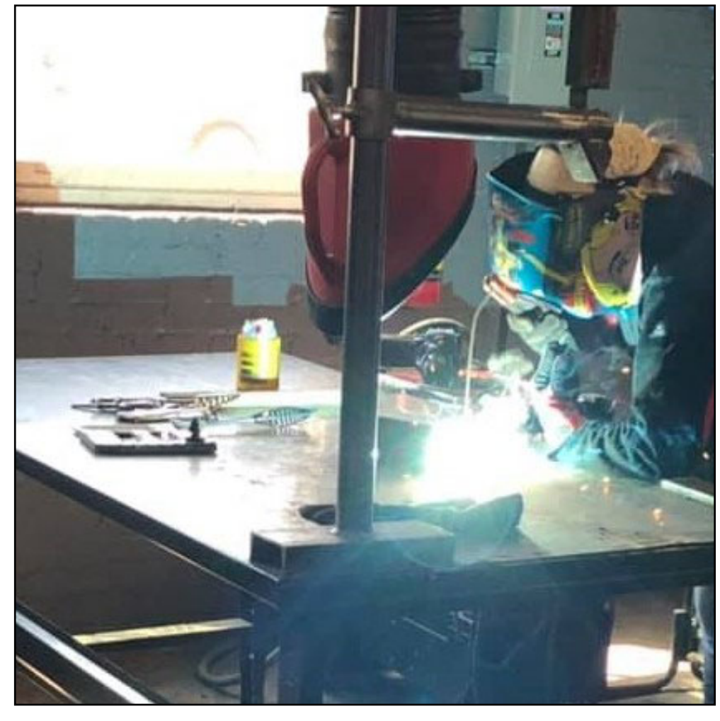
SCCC students now get to learn and practice their welding abilities at the newly founded facility here on campus.

With Sussex County being as rural as it is, and there being such a big industry attached to the area for farming, mechanics, and other related trades, it only seems fitting that SCCC would offer courses in those fields for students.