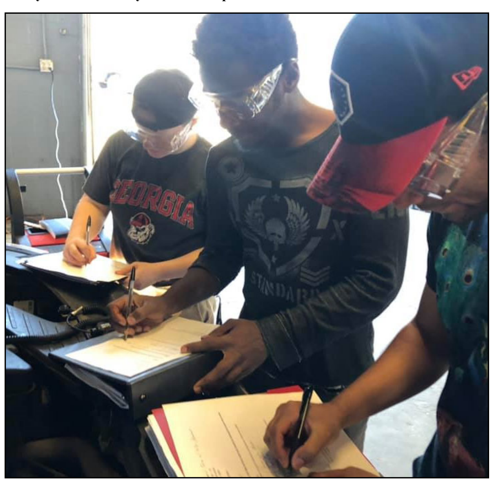
SCCC students reviewing notes together on the work site.

they have learned here through their courses.