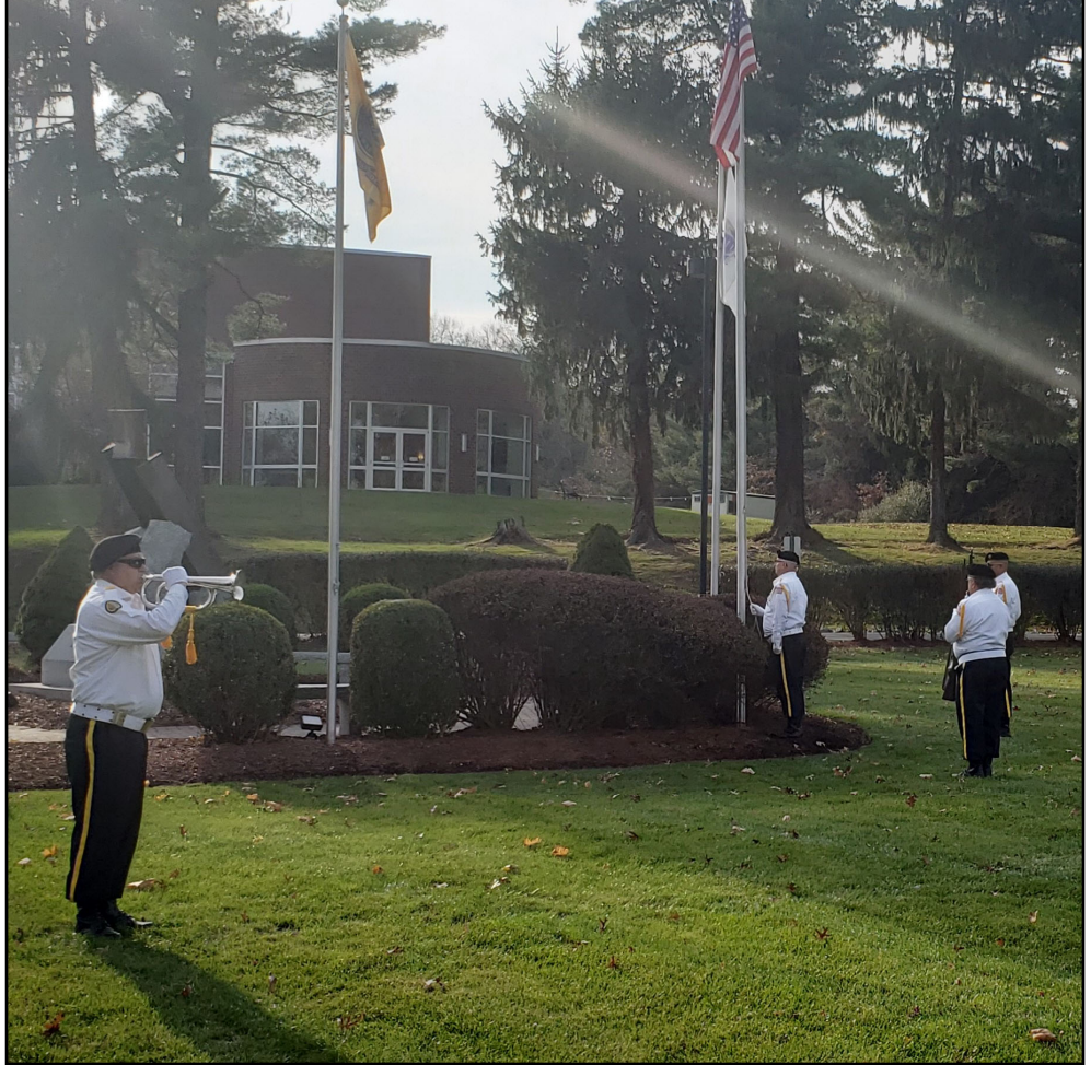
"Taps" sounds as the flag is saluted in commemoration of those who have served in our nation's military.