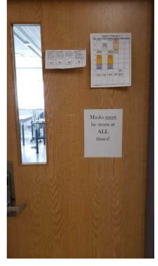
While most learning was online, those students in classrooms practiced masking, six-foot distancing and smaller class

"I am really impressed with the amount of flexibility and perseverance that our