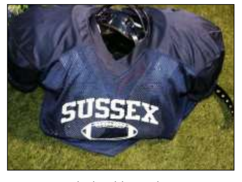
A jersey with shoulder pads.

No doubt there is great excitement that sports are back in our community and for our students to enjoy in a different type of fashion. With each team getting extended time to practice and build chemistry students can't wait to see how well SCCC does in the spring seasons.