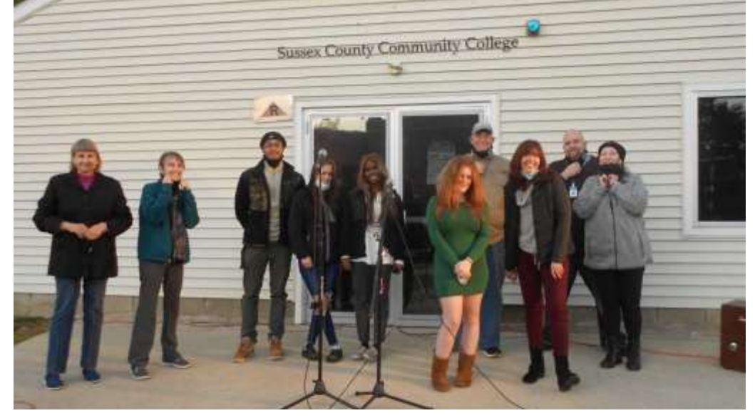
Students came to both perform and listen at the Studio 20 Open Mic event.

people were able to make it to the open mic, and even fewer wanted to participate. But those who did, did so fantastically. The crowd numbered about 15 people that afternoon.