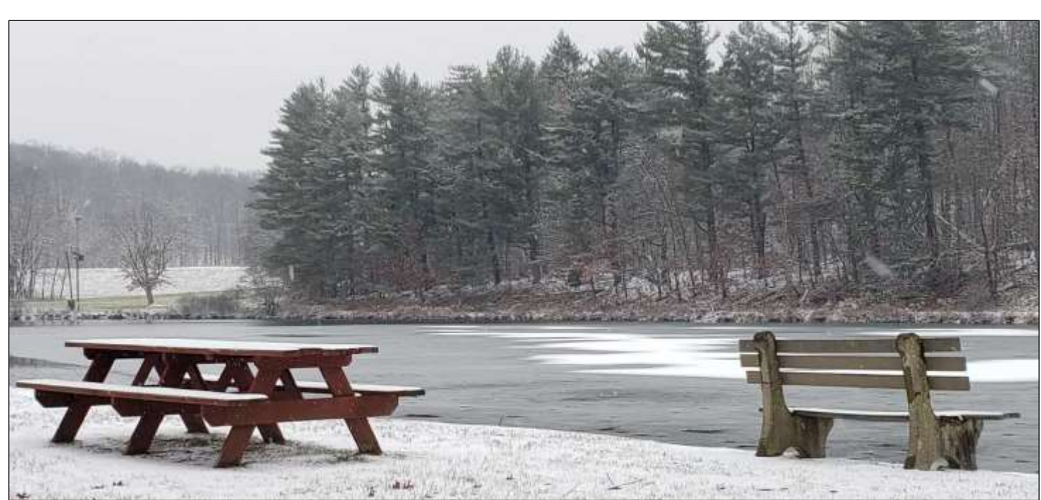
The pond looked like a nice place to sit and think after the first snowfall, but only if one brushed off the seats.