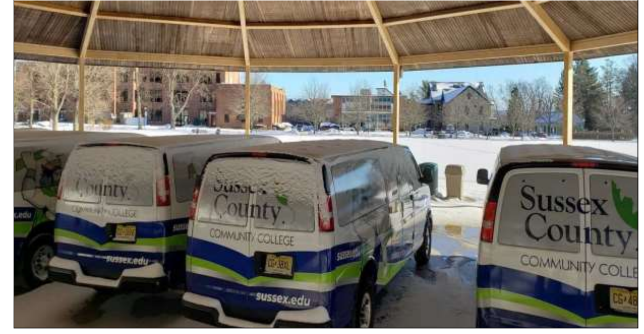
During the Dec. 17 storm, the gazebo on Connor Green served as a parking garage for several college vehicles.