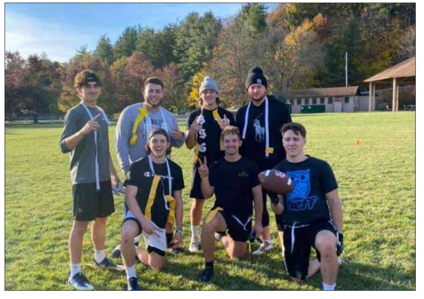
The Monster Bowl, in which these students played, was but one of the events throughout the semester of COVID.

She said they decided for Fall 2021 to host three flag