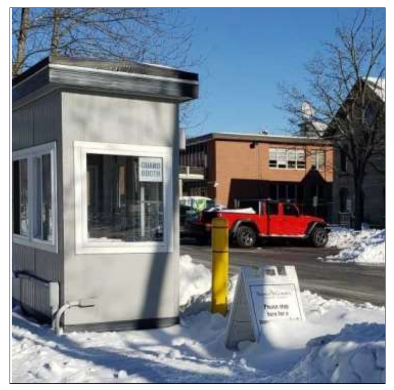
After the second storm, there wasn't much checking of temperatures at the guard shack.