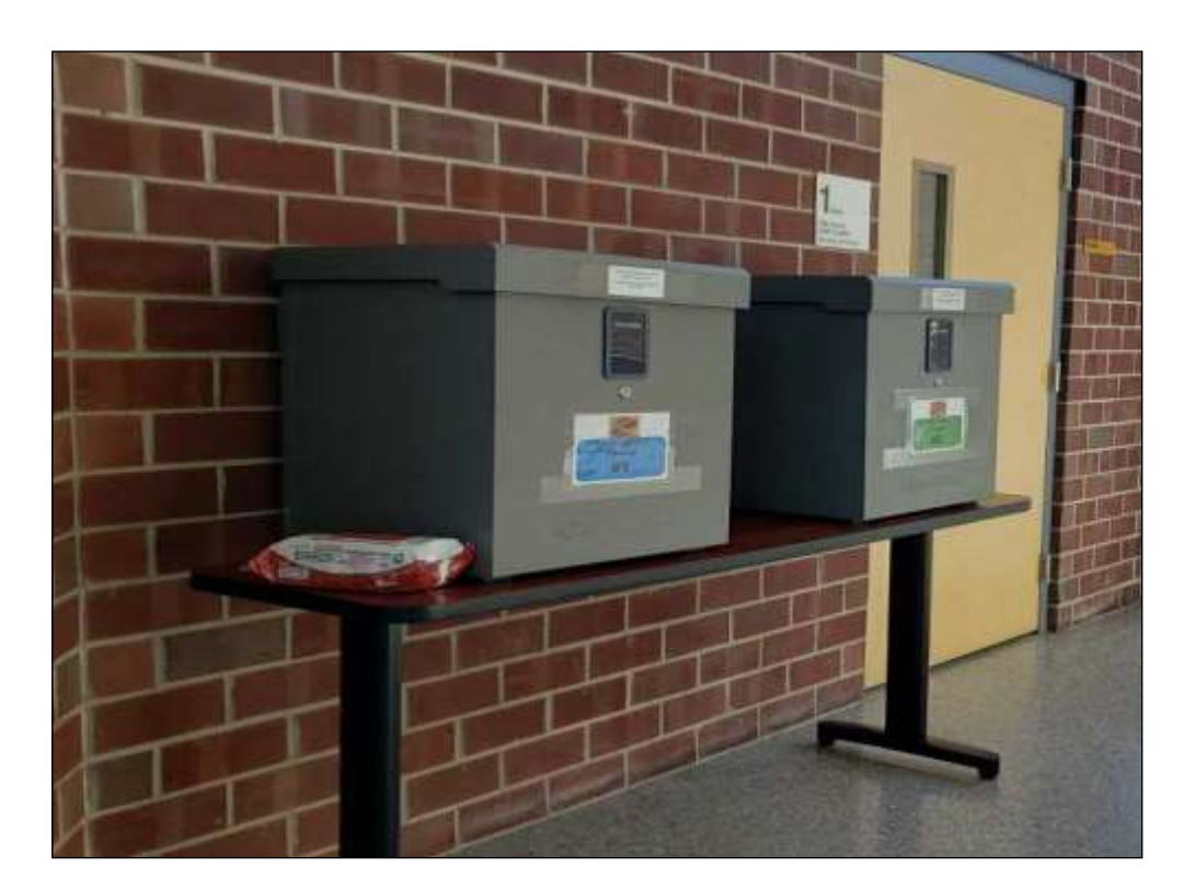
The Takeout Boxes, located on the third floor of the science building. They are accessed with codes provided by the library's staff to make sure the library materials inside are given to the ones who requested them. College Hill photos

The library staff plans to use the boxes for a long time. It helps reduce the spread of the virus, and its convenience to students and faculty is excellent.