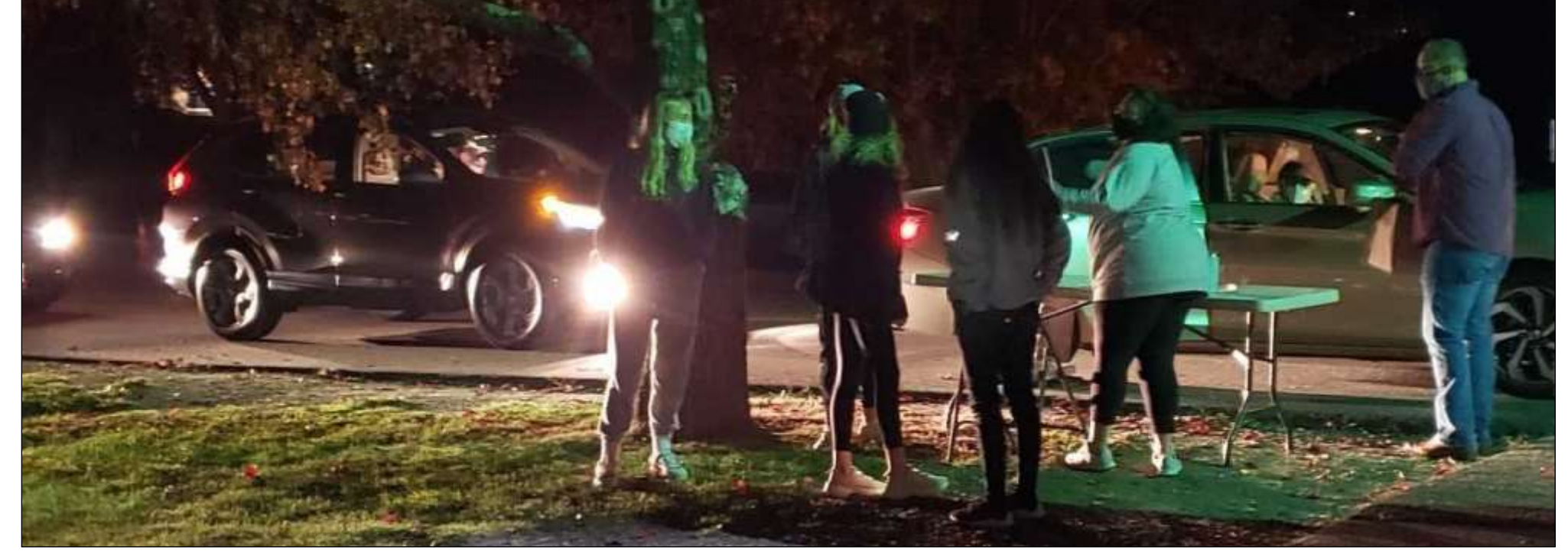
It's takeout for most people, common the time of COVID, with volunteers serving cars that lined up on the road alongside the Green.