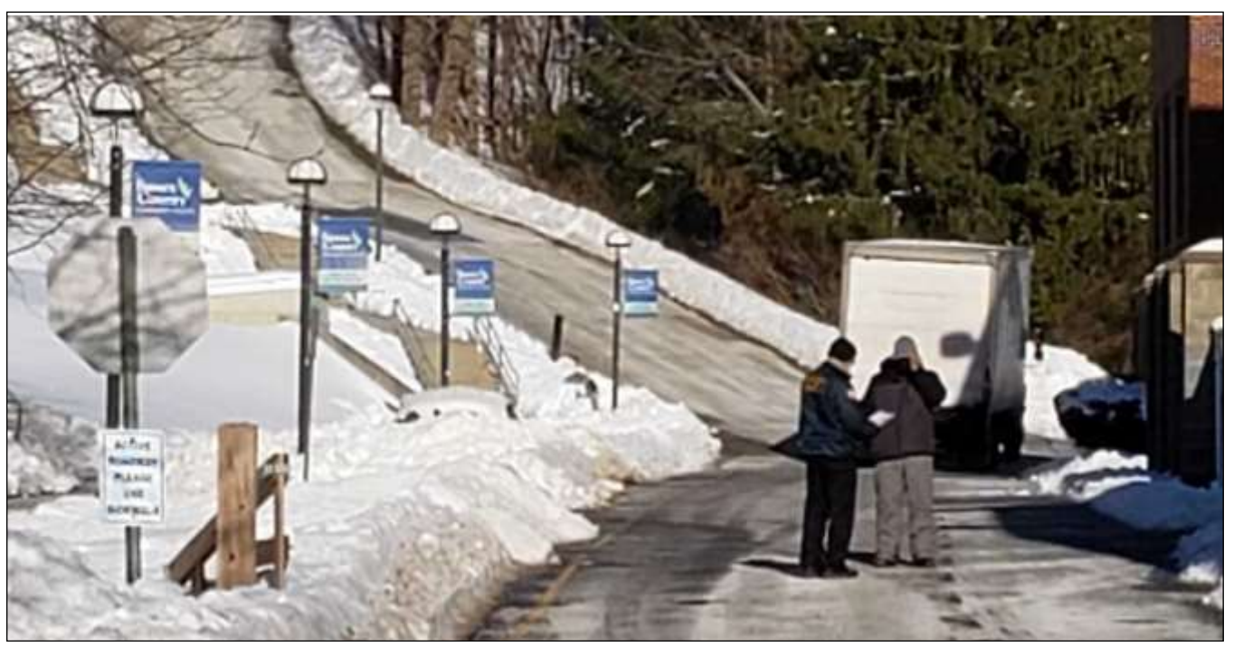
Security personnel and delivery people were about the only ones on campus after second storm.