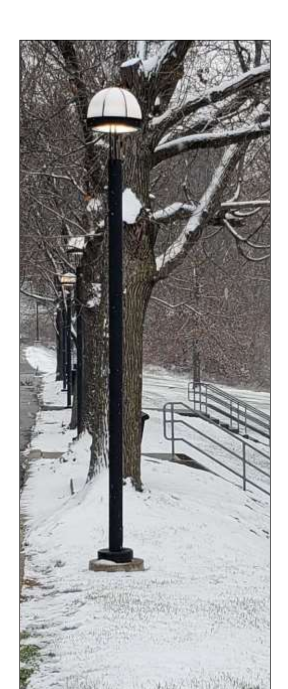
By late afternoon, the lights were on.

But the second was a bear, closing the campus. Excepting the snow, the empty campus looked much as it had all semester. But this storm revealed a change of the digital era: Future storms will indeed shut down the campus, and then students will just log onto Canvas and get to class.