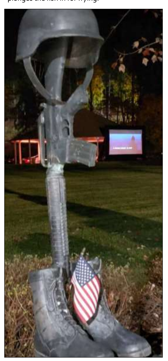
Movie also showed on reverse side of screen.